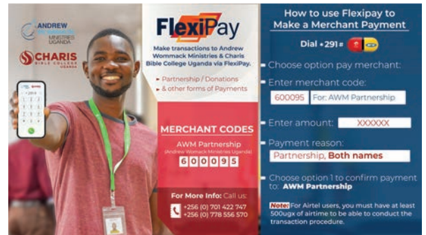
How to give using FlexiPay, instructions for Partners.

Watch full video by clicking the link blow: