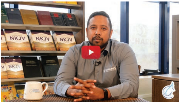
Director's Announcement to Partners about Ministers' Conference Uganda 2/3/4 June.

To learn more about ways to leave a gift to the ministry at your homegoing, please feel free to call us at 719-635-1111 and select Option 5 for Partnership. You can also send an email to LegacyGiving@awmi.net , or write to us at AWM Partner Relations, PO Box 3333, Colorado Springs, CO 80934.