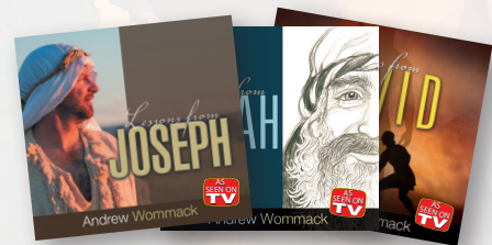
As-seen-on-TV DVD Series

Do you have a clear vision for your life? God still speaks to people through dreams and other means, and He wants to lead you in a very specific direction if you'll let Him. The importance of understanding God's purpose for your life is just one of the many life lessons you'll learn in these powerful teachings. Spare yourself the pain of learning things the hard way by arming yourself with the life-changing Lessons package.